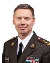
Kaspars PUDĀNS Chief of Defence of Latvia