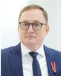
Mārtiņš KAZĀKS Governor of the Bank of Latvia

European Commissioner for Economy and Productivity; Implementation and Simplification, Former Prime Minister of Latvia