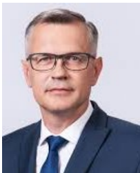
Ainars LATKOVSKIS MP Chair of the National Security Committee of the Saeima