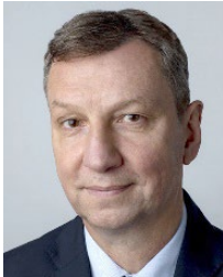
Andrzej HALICKI MEP

Vice-Chair of the EPP Group in the European Parliament, Chairman of the EPP Group's Working Group on External Policies (AFET)