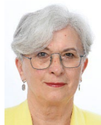
Sandra KALNIETE MEP

Vice-Chair of the EPP Group in the European Parliament, Chairman of the EPP Group's Working Group on External Policies (AFET)