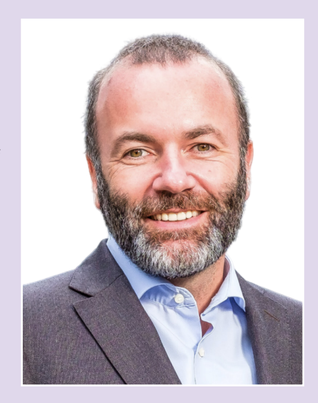
Manfred Weber MEP Chairman of the EPP Group in the European Parliament

As a direct result, in June 2020, the European Parliament set up the Special Committee on Beating Cancer (BECA). The members have done tremendous work - with the goal in mind to join efforts, knowledge and money in Europe to fight one of the most dreadful diseases known to man. The experts tell us it is possible, it is only a matter of political will to make progress for millions of people across Europe.